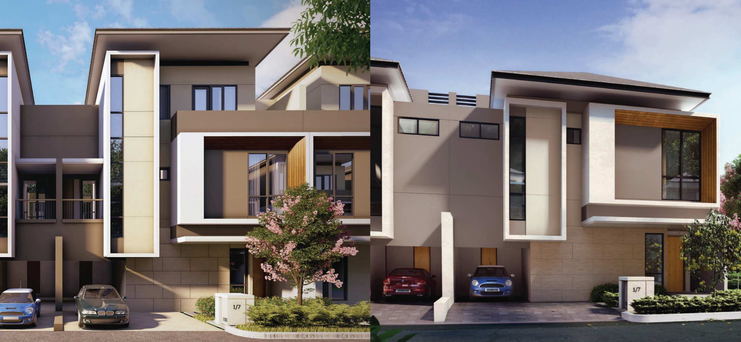
TYPE 10m x 14m 3 FLOORS